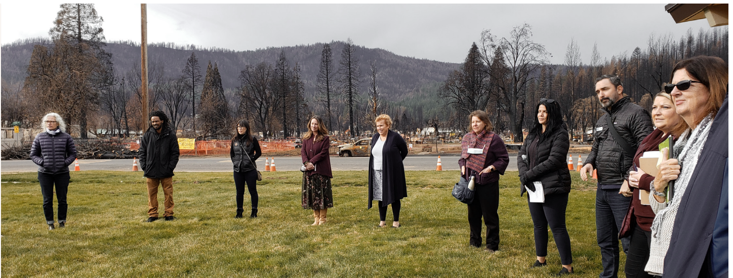
Members of the Dixie Fire Funders Roundtable gathered in Plumas County in October to tour the affected communities.