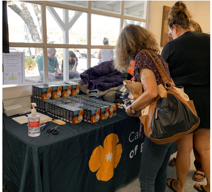
Fire survivors collecting supplies during the Bear/North Complex Fire anniversary event at the Wildfire Resource Center.

All told, NVCF has issued $1,167,940 in grants for Bear/North Complex Fire survivors.