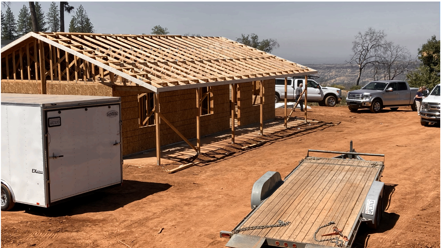
A home built in Paradise by Hope Crisis Response Network volunteers.